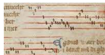
The Gruuthuse Manuscript, Literature, Music, Devotion around 1400

about late-medieval urban culture in the Netherlands. In addition to prayers and poems, the manuscript includes the oldest known collection of songs with a musical notation in the Low Countries: songs of courtly and uncourtly love, songs of fellowship and religious songs and hymns. www.textualscholarship.nl/?p=10647