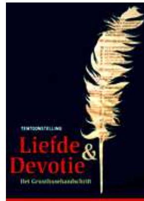
Love and Devotion: The Gruuthuse Manuscript

In 2013 the Gruuthuse Manuscript will be returning to Bruges for the exhibition Love and Devotion. This exhibition will bring the visitor back to Bruges