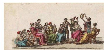
MOISA: Music, Cults and Rites of the Western Greeks

systematic study. The goal of this conference is to investigate the musical characteristics and phenomena of southern Italy and Sicily in the Greek area. The topics of interest include music as an element of élite identity in Magna Graecia and Sicily. Info: www.moisasociety.org/